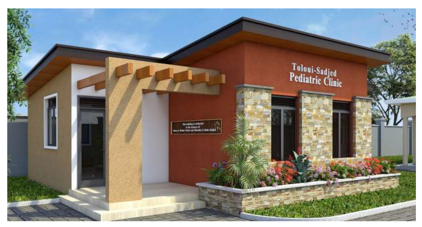
The sign on the left will be dedicated to Hugh and Flor's parents and our Rotary Club.