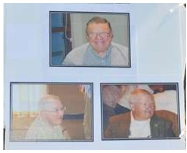
THEIR SPIRIT WAS WITH US