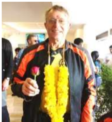
THE ROSE PRESENTATION