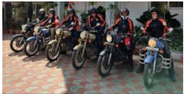
A FEW OF THE 90 PARTICIPANTS