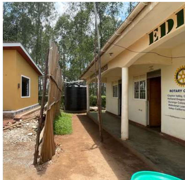
THE CLINIC ON LEFT AND THE DISTANCE TO THE MAIN OFFICE