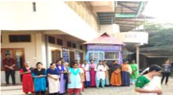
FACILITY THAT HOUSES ABANDONED WIDOWED WOMEN