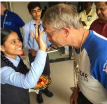
THE BINDI FOREHEAD MARKING