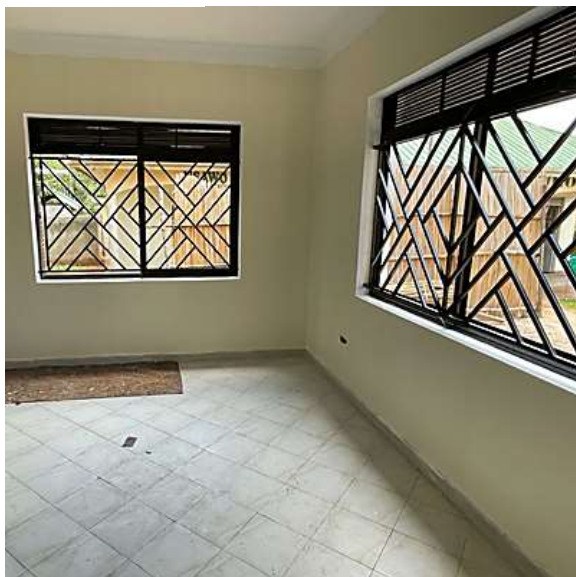
CHECK OUT THOSE FLOORS