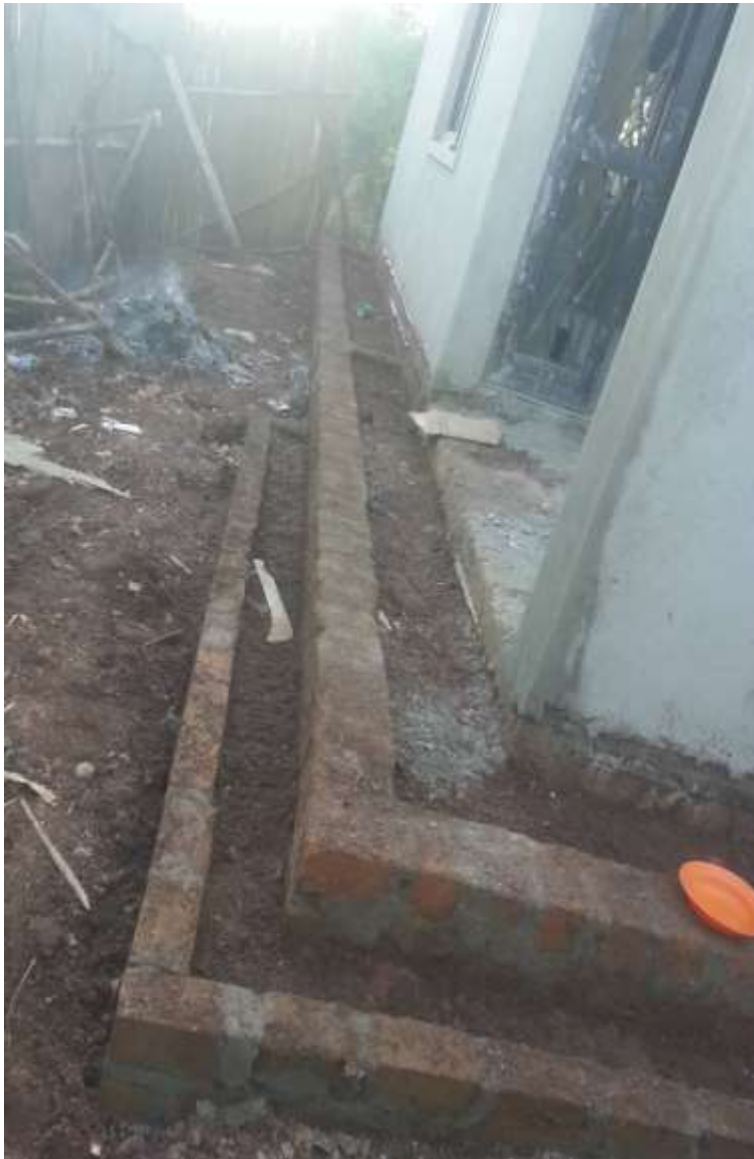
THE FLOWER BEDS