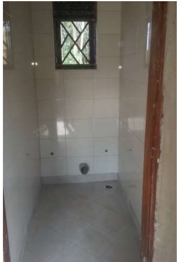
TILING WORK COMPLETE