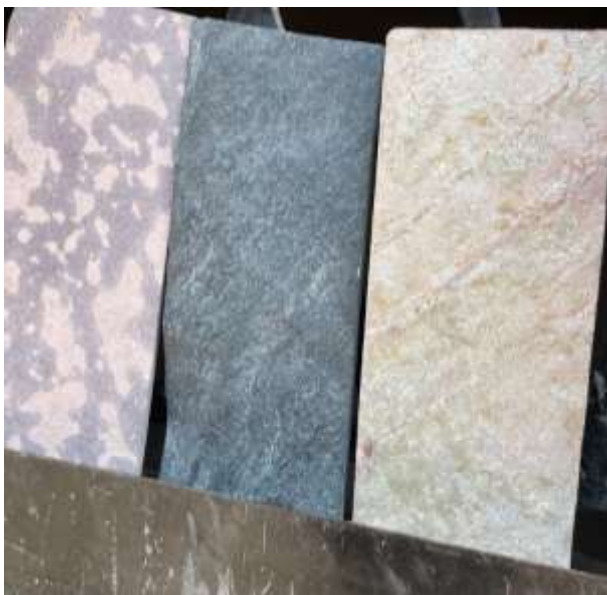
STONE SAMPLES SELECTED

Wow. Take a Look at what we accomplished just one week later.