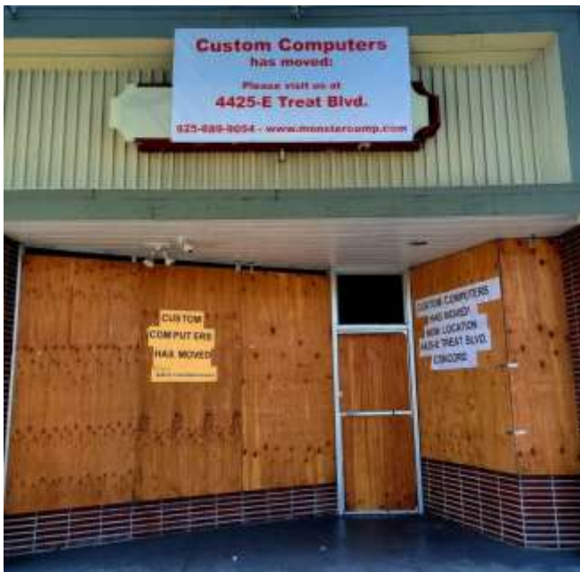
OUT WITH THE OLD