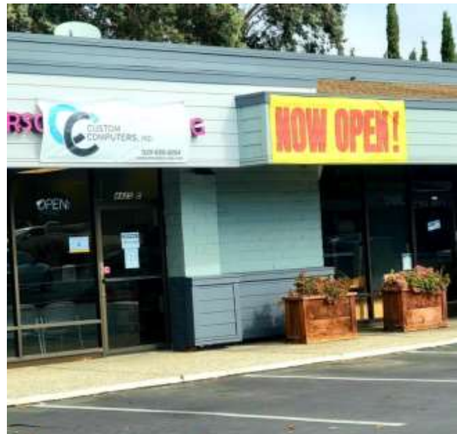
IN WITH THE NEW