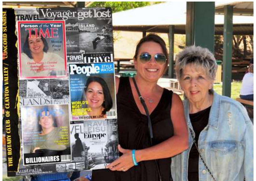
MONICA RECEIVED HER PETS POSTER