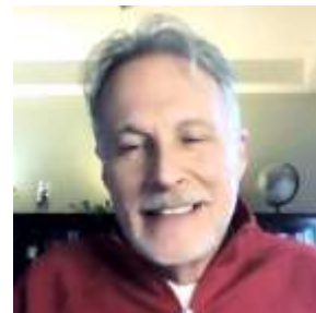
CARL “CW” WOLFE Mayor City of Clayton