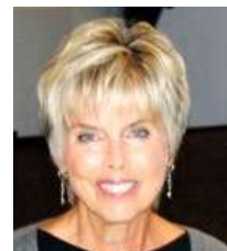
Immediate Past President