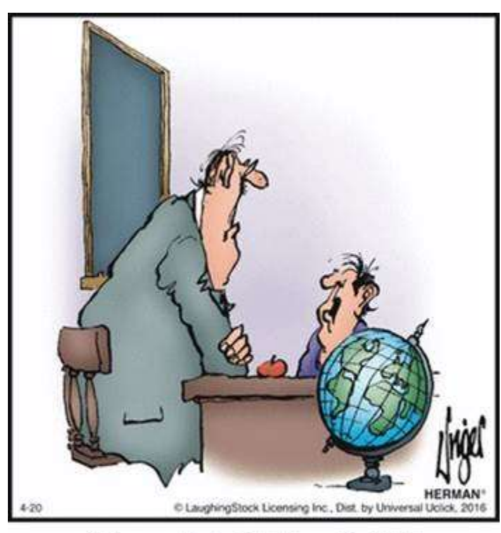
"The capital of Holland is 'H."