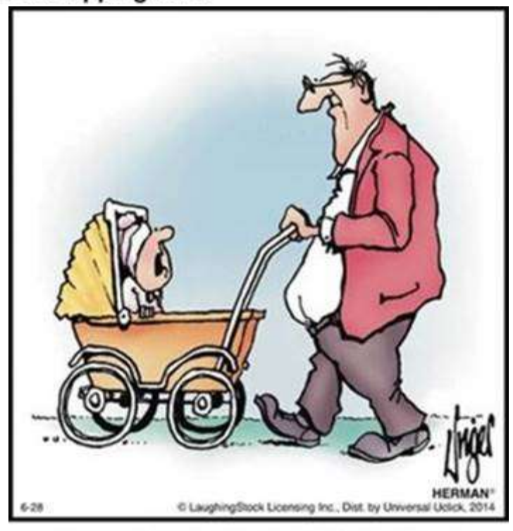
"Have I gotta sit here looking at you everywhere we go?"