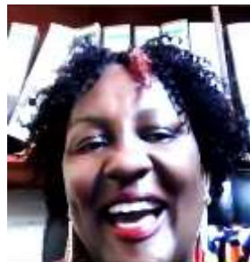
DEB LUYLIMA International Services