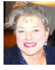
Immediate Past President