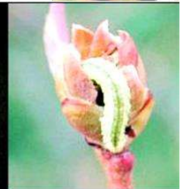
Winter Moth Larva