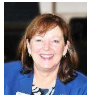
DISTRICT GOV TINA AKINS