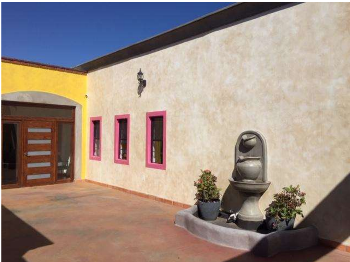
This is the entrance to the hospice annex of the new Cancer Center