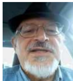
EDI BIRSAN Galaxy 58 Former Concord Mayor