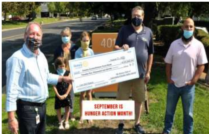
SECOND $25,000 CHECK PRESENTATION