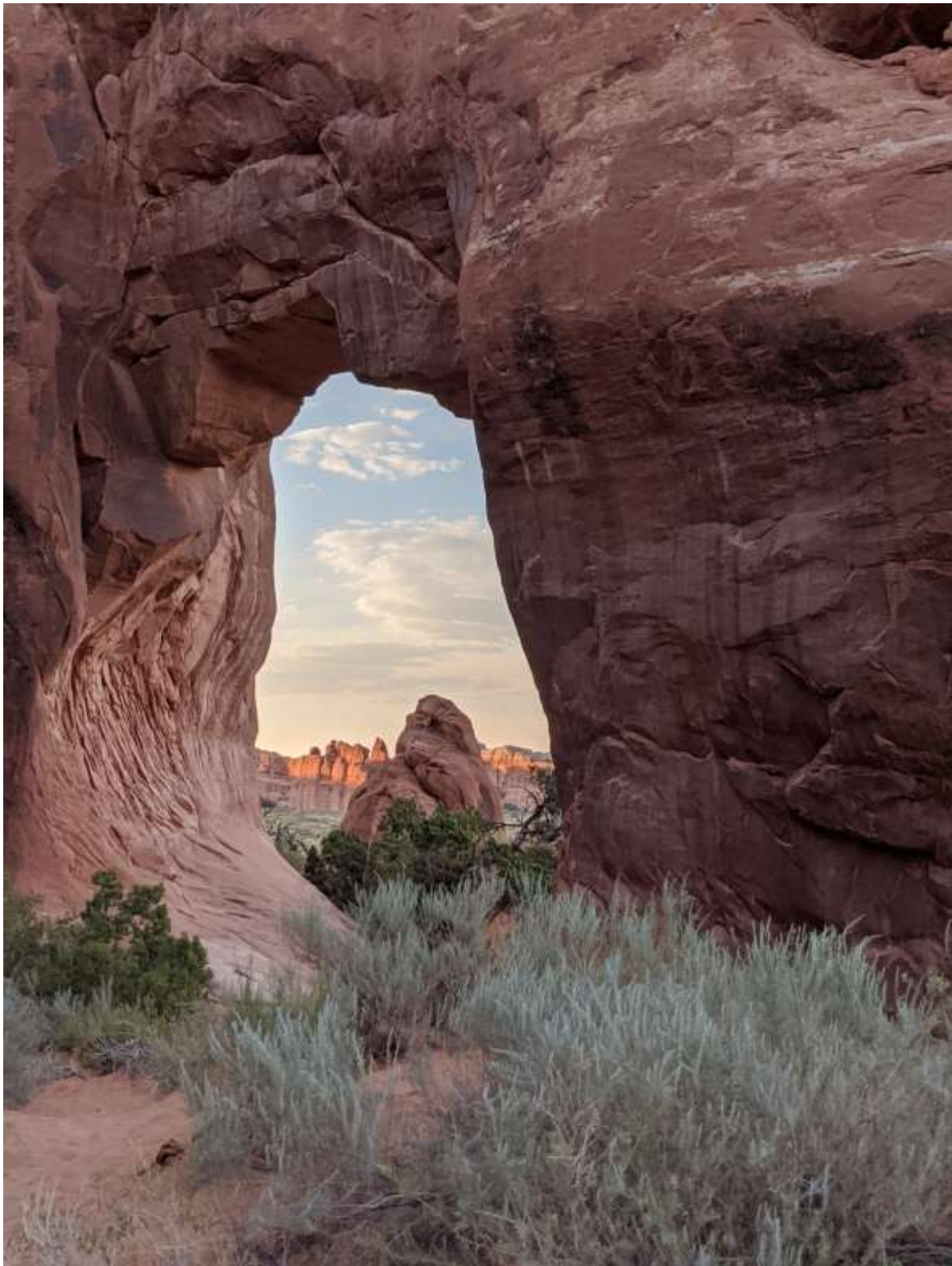
Slot Canyon Escalante, Utah