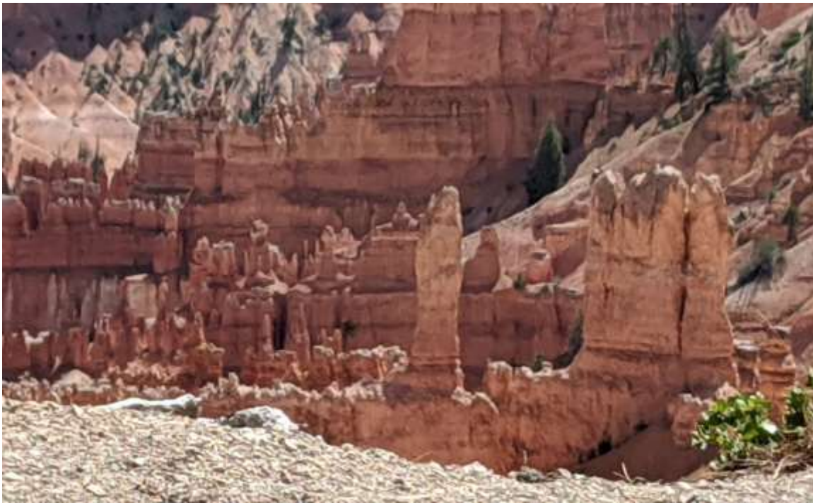
Bryce National Park, Utah