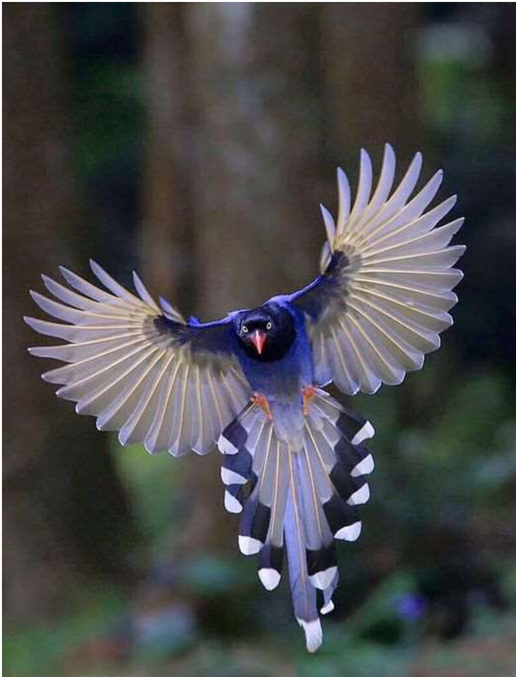
The Taiwan Blue Magpie