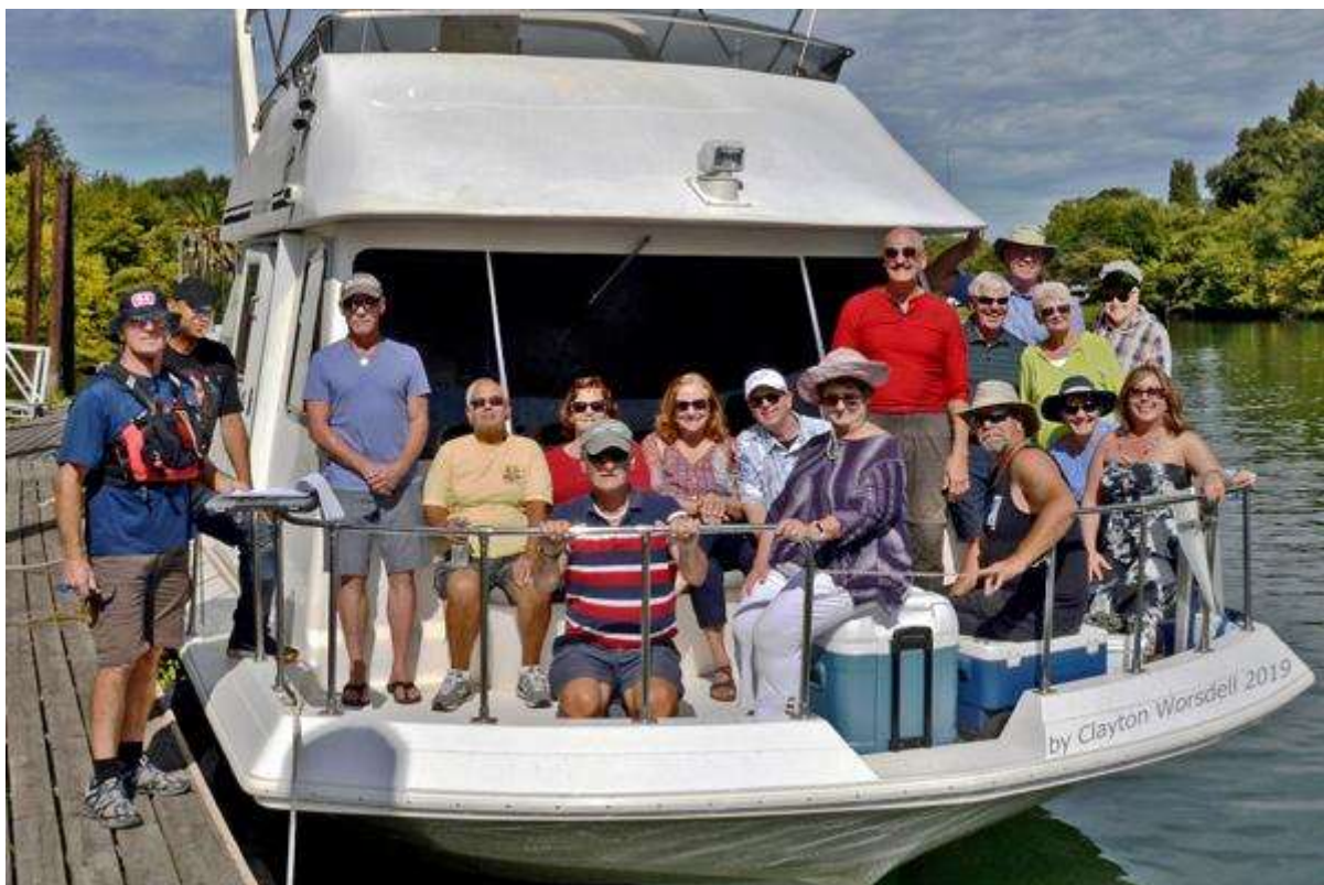
Flipper and the Paradise volunteers

The Rotarians hung in there. Many of them made themselves comfortable by taking naps in the main cabin and on our bed in the stateroom! It was dark when we made it back to port and managed to berth Flipper without a scratch! As I said, "it was quite a day."