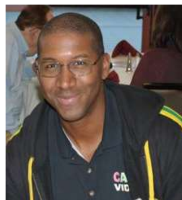
CLIFTON BARNES CA&C Video Productions