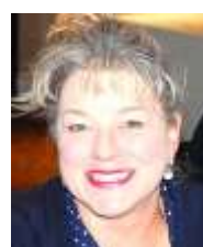
Immediate Past President