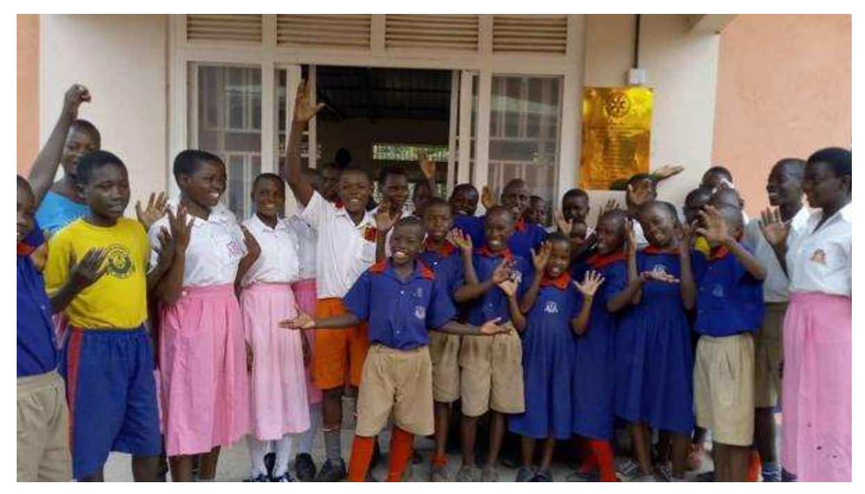
Pupils from the neighbouring schools are excited about having a chance to access computers.