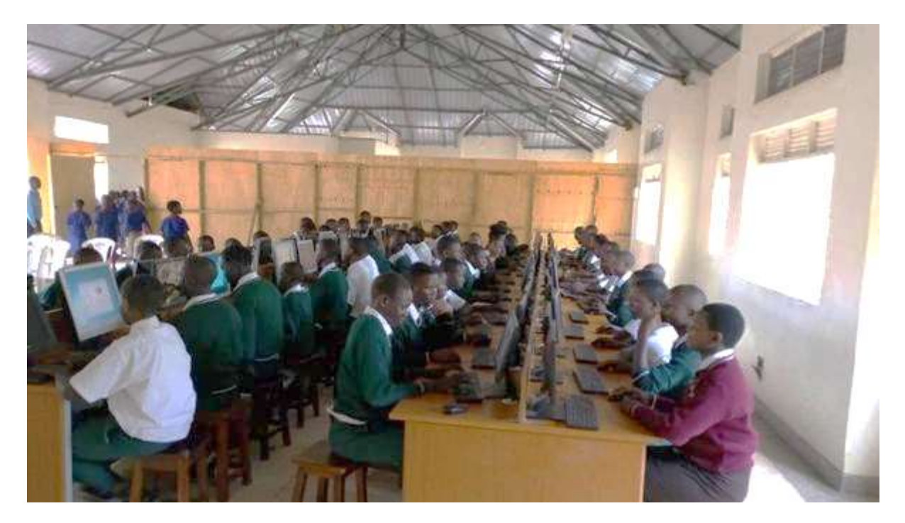
Students of SSAKU Senior Secondary School clicking away for the very first time