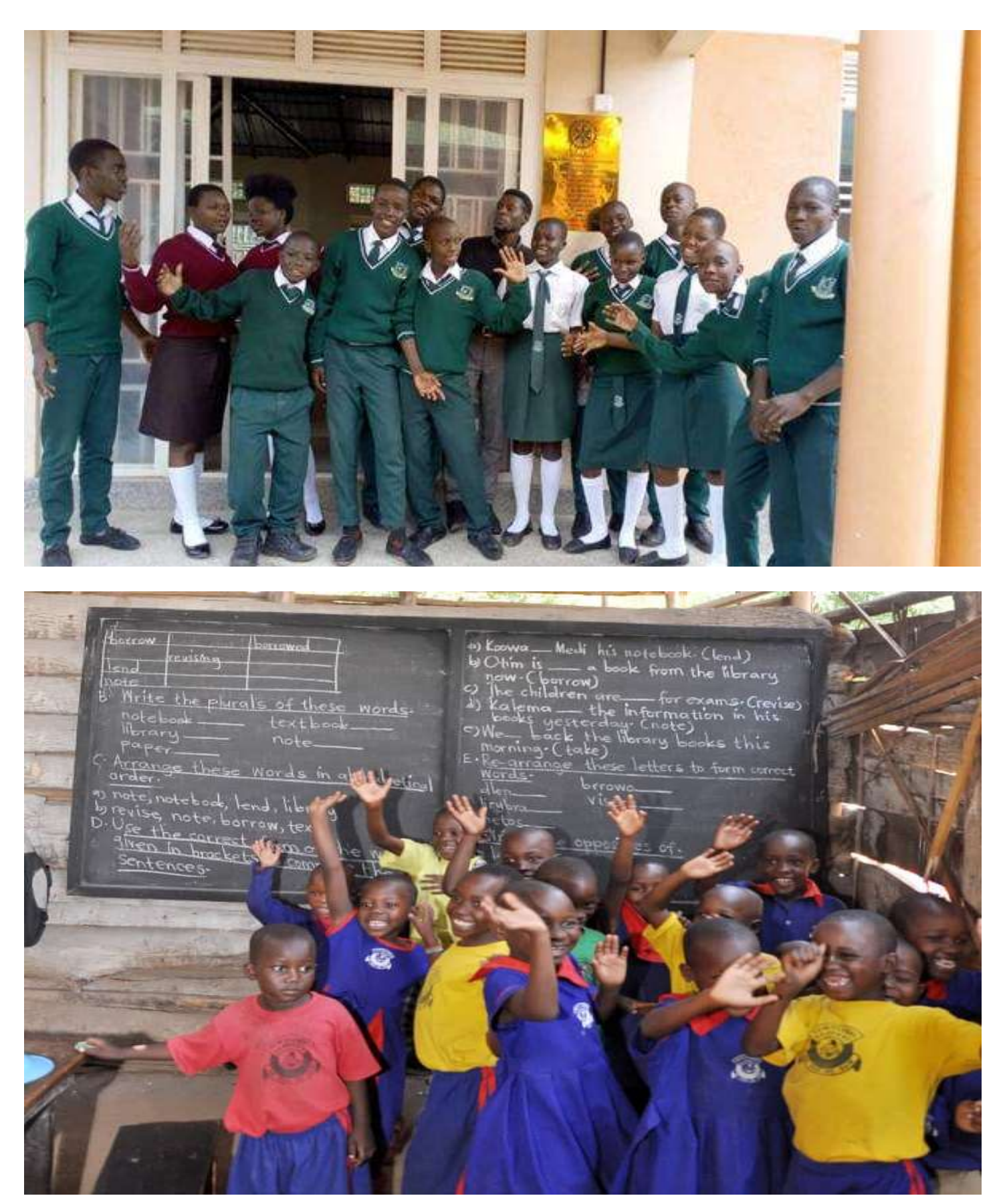
Rotary does, indeed, connect the world.