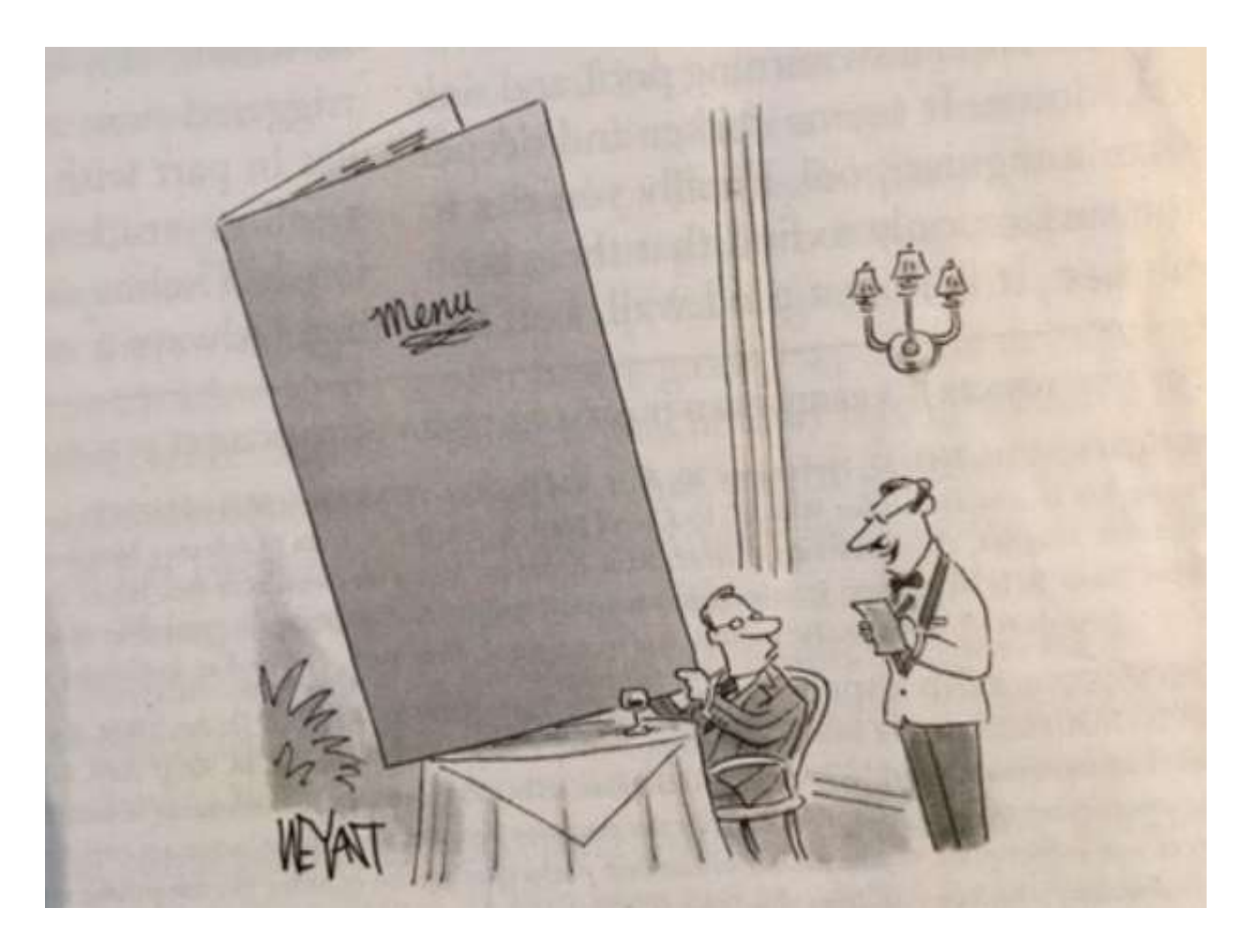
"Can I tell you about a few items that aren't on the menu?"