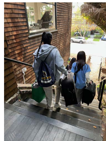
The photos above are Interactors at the Collignons; on arrival, and leaving on Sunday morning, laden down with sleeping bags and gear.