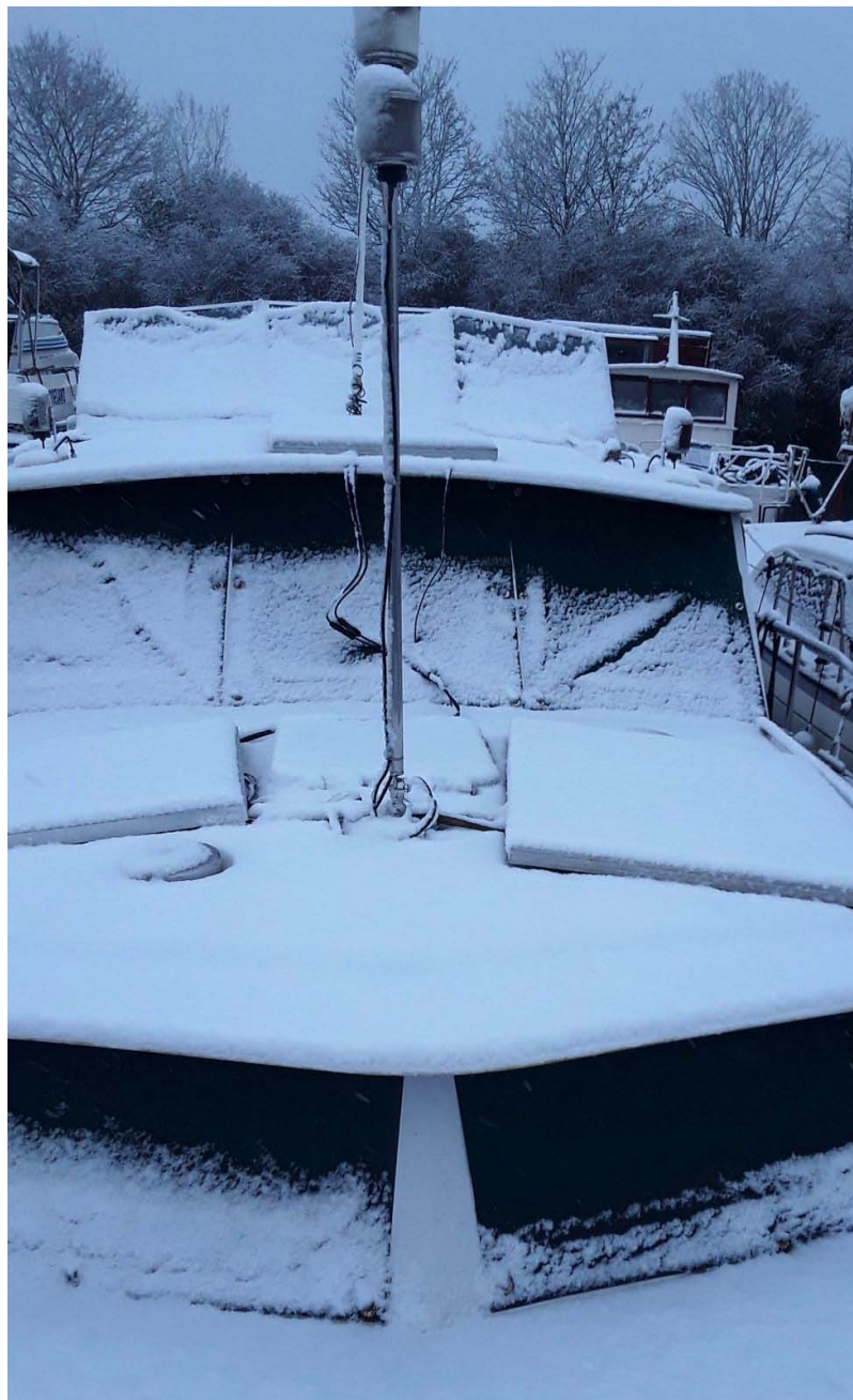
Boating in Saint Jean de Losne, Burgundy, France