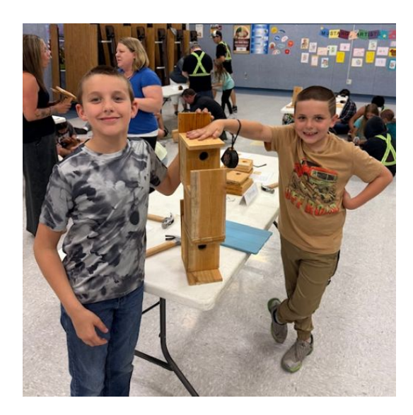
Measure Twice, Cut Once: Birdhouse Project