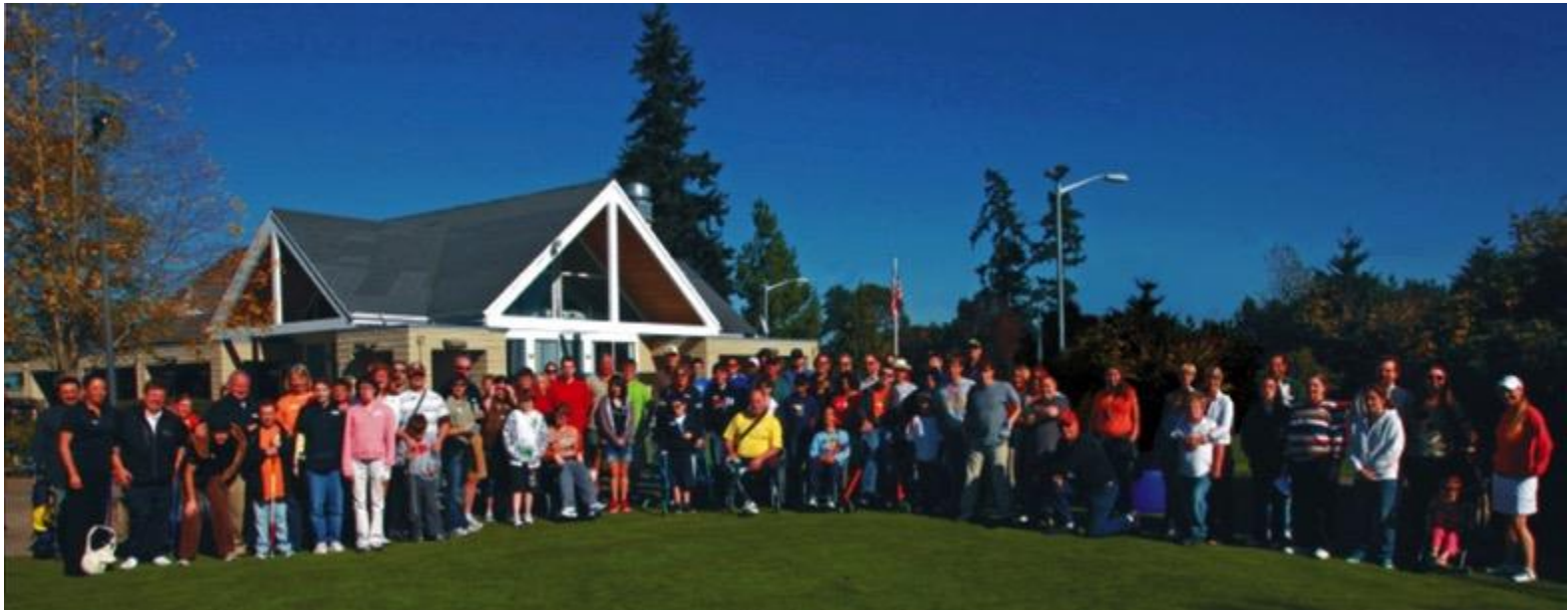
Lake Oswego Public Golf Course