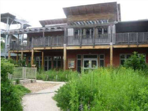
Urban Ecology Center