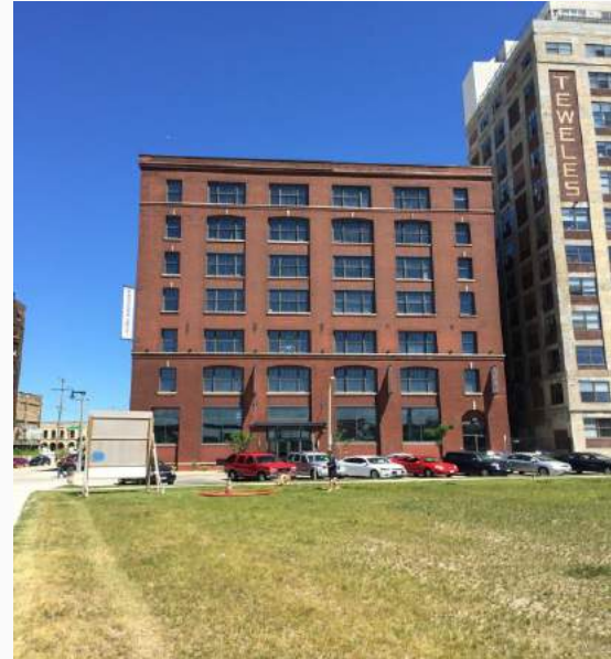
World Water Hub