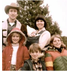
35 YEARS AGO