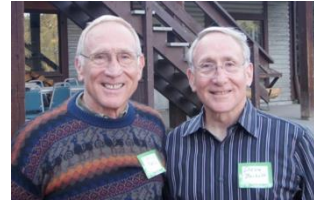
WITH MY TWIN BRO

PERSONAL: Married, 4 children, 1.5 grandchildren From Glendale CA; have lived in four states