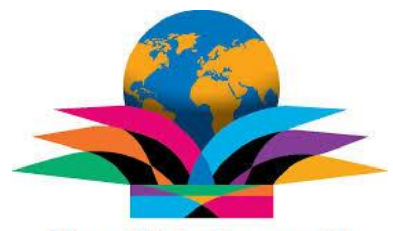
Be a gift to the world