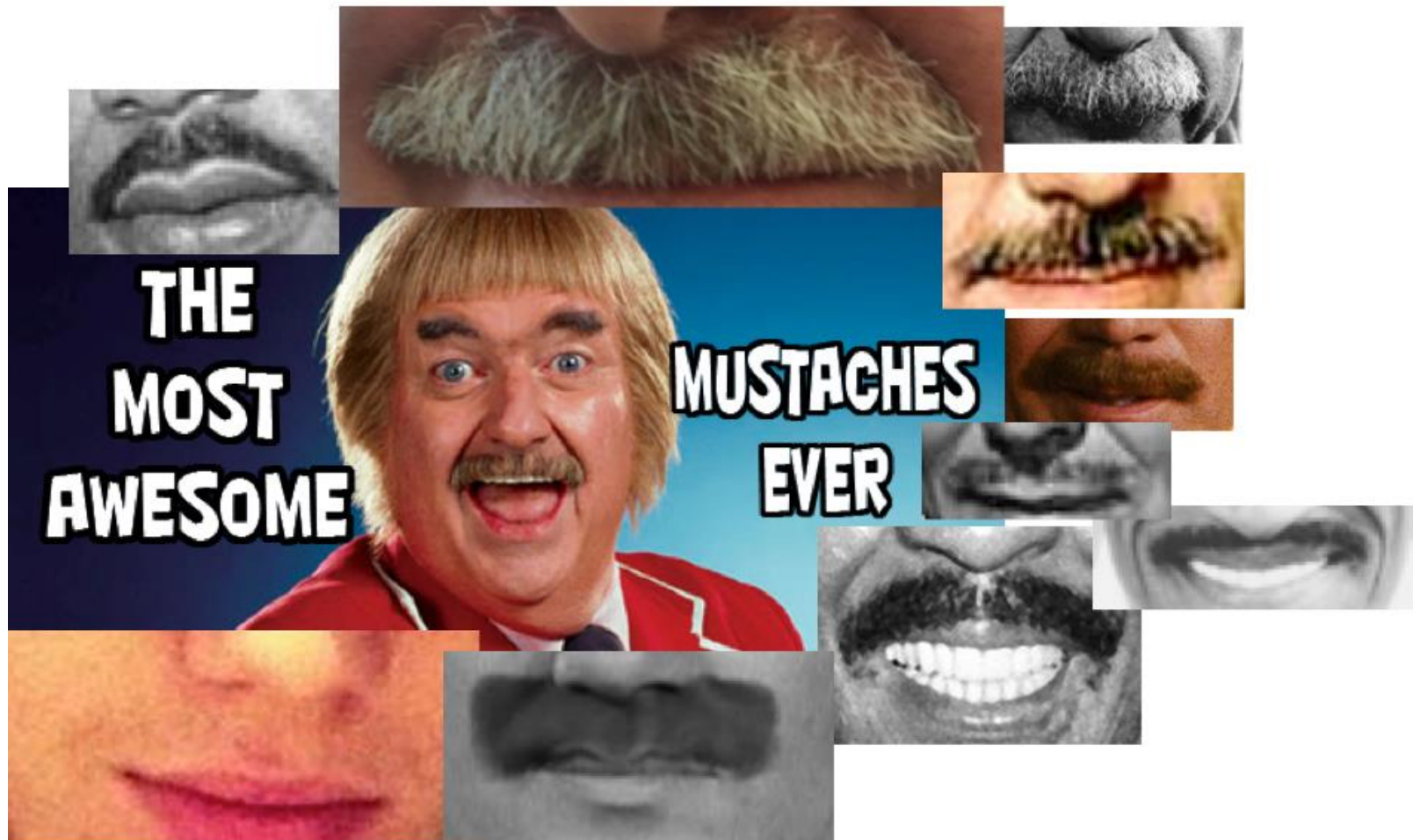
TABLE TEAMS: NAME THE MUSTACHES TO WIN A TEAM PRIZE!!!

**$25.00 - MUST PURCHASE TICKETS OR RESERVE PRIOR TO JUNE 8**