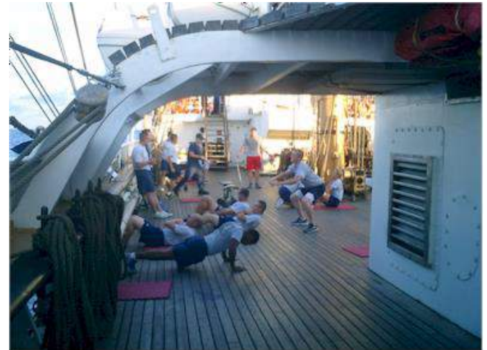
2 workouts per day