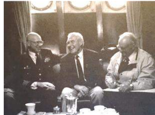
Sea stories with German crew

Former Captain of the Eagle Sailed to Germany 1996