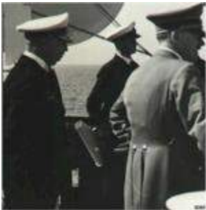
Hitler aboard 1938