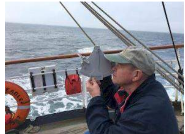
Apparent noon with Sextant