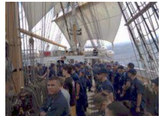
Captain Matt Meilstrup

7 officers, 50 enlisted +150 Cadets 6 to 8 weeks aboard in 4 years