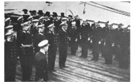
Commissioned May 15, 1946 US Coast Guard Eagle

5 months of repairs Sails, lines, rudder, paint