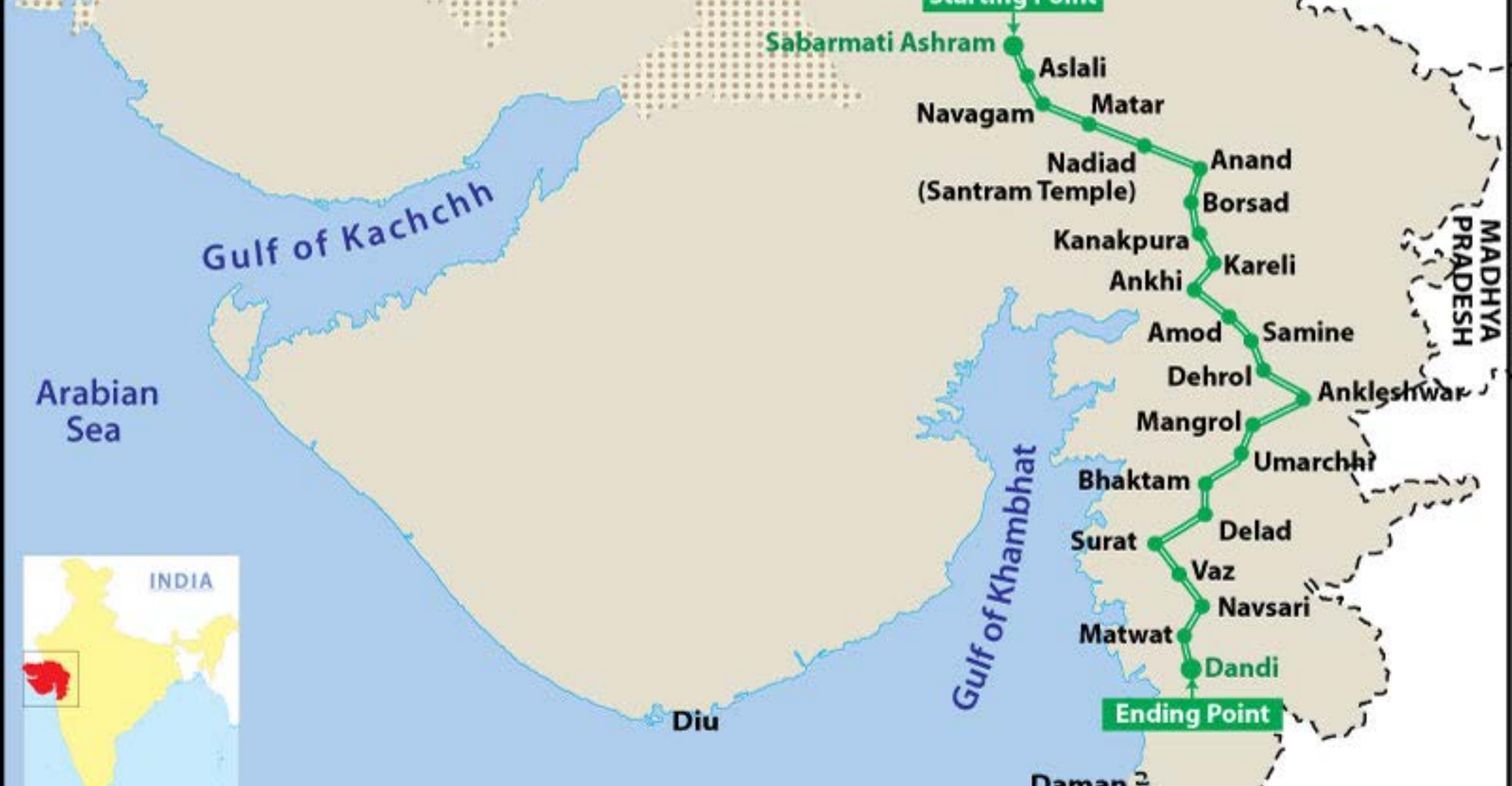
THE GANDHI WALK