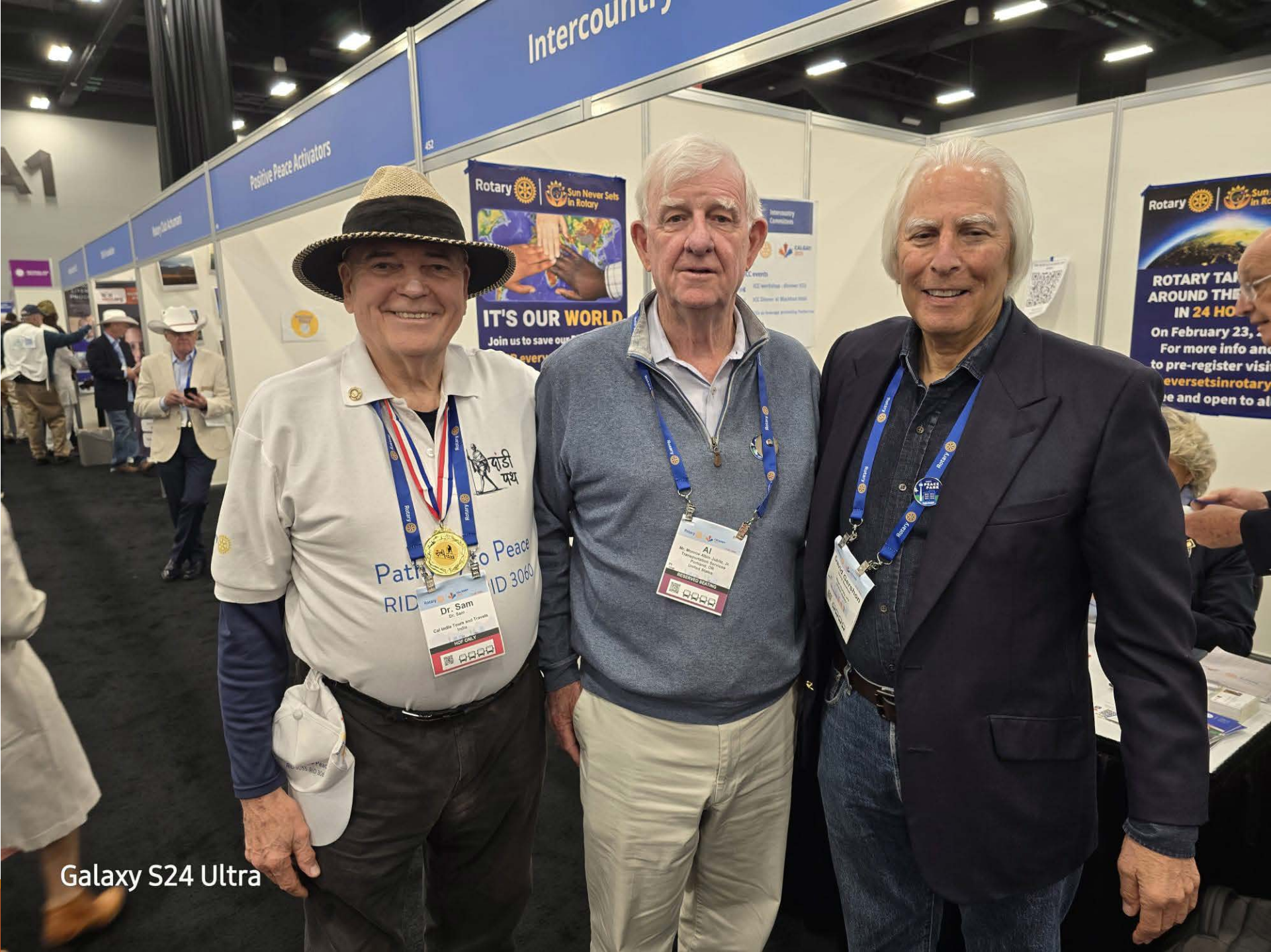
Galaxy S24 Ultra