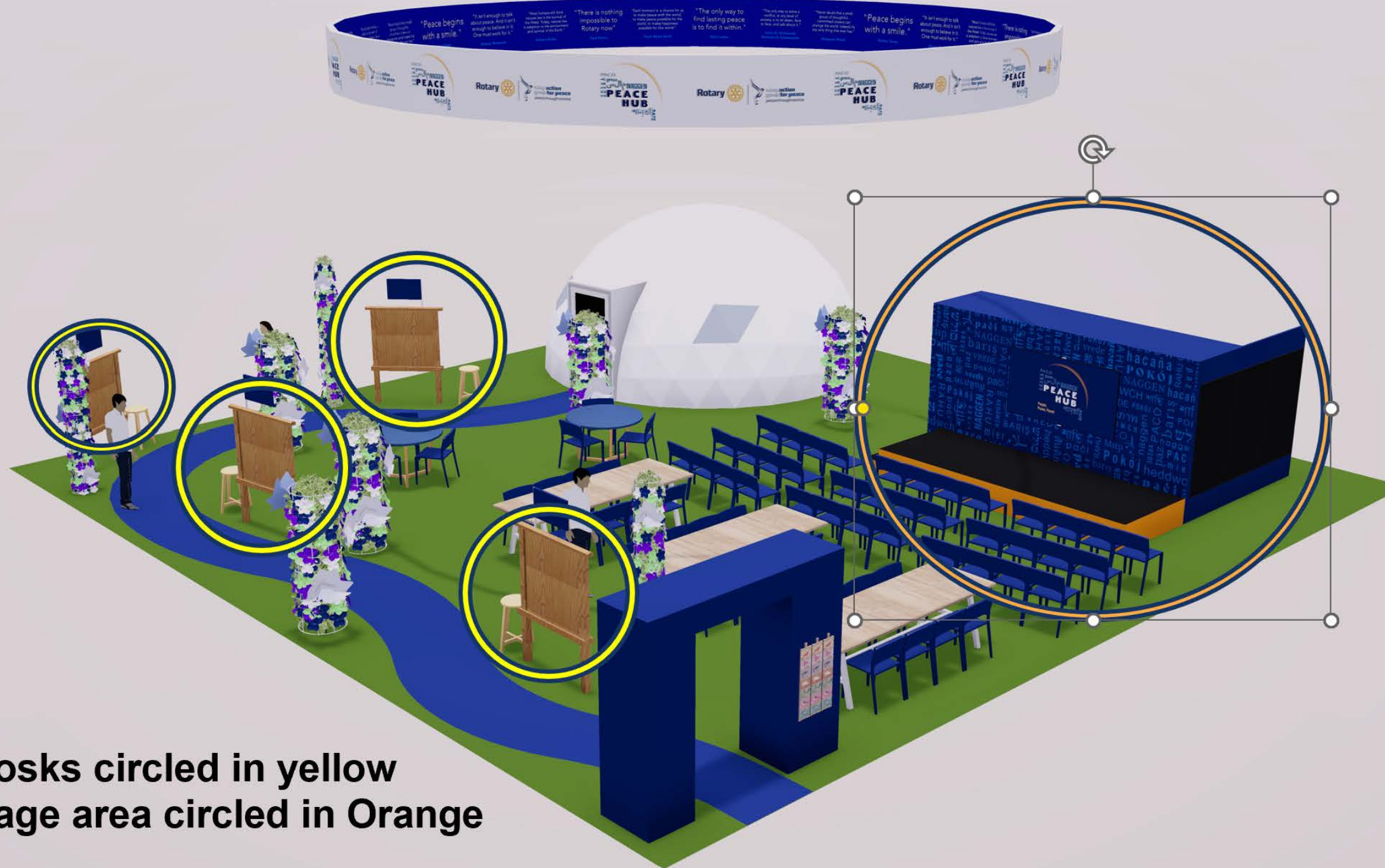
Kiosks circled in yellow Stage area circled in Orange