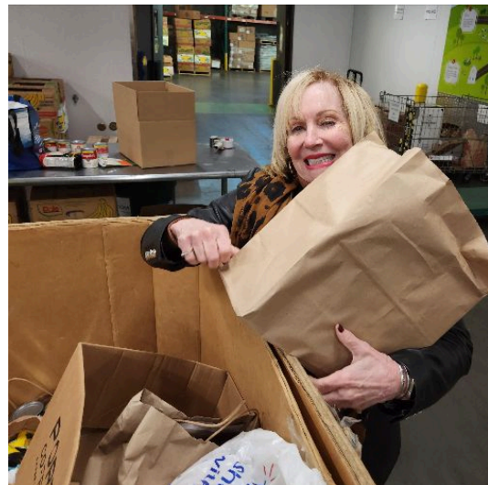
The Rotary gang at Winco shopping for 18 families in the Camas Washougal area for Thanksgiving. This annual project is partially