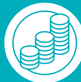
COMMUNITY ECONOMIC DEVELOPMENT