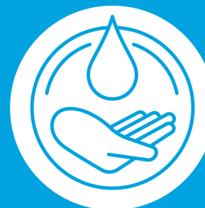
WATER, SANITATION, AND HYGIENE