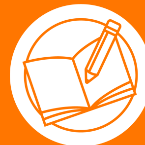
BASIC EDUCATION AND LITERACY