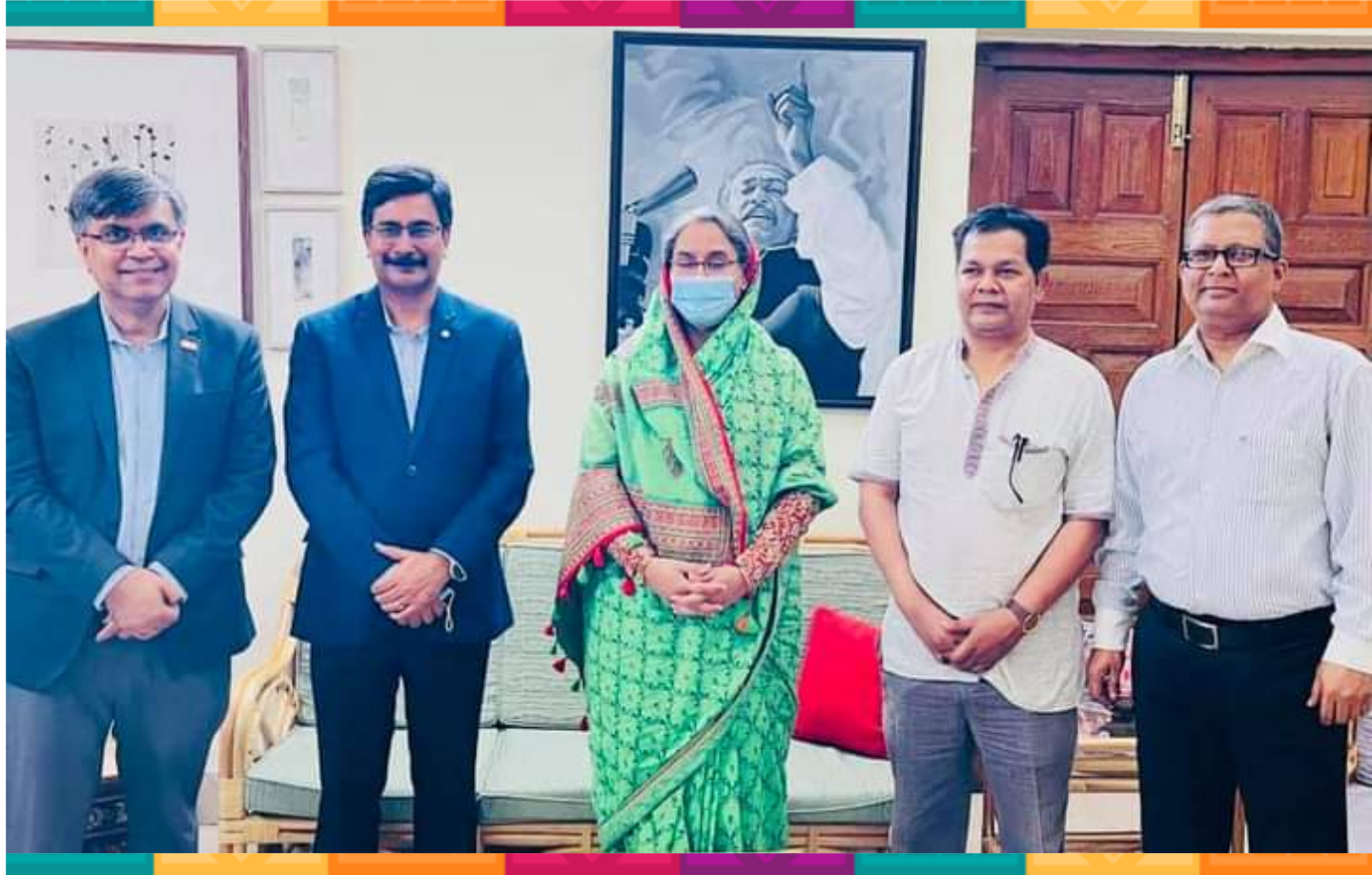
Meeting with Hon'ble Minister of Education

In assistance with the Ministry of Education of our Government