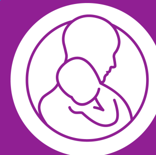
MATERNAL AND CHILD HEALTH