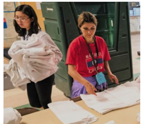
Example: $15,000 for security equipment and training for ROOTS young adult shelter in U District (2022)

Let's work together to get some outstanding applications from non-profits so we can continue to make a difference!