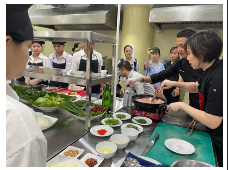
Cocoon Project by the Rotary Club of Danang, hospitality training for orphans and street children. Our 2023 team will attend a dinner prepared and served by these students.