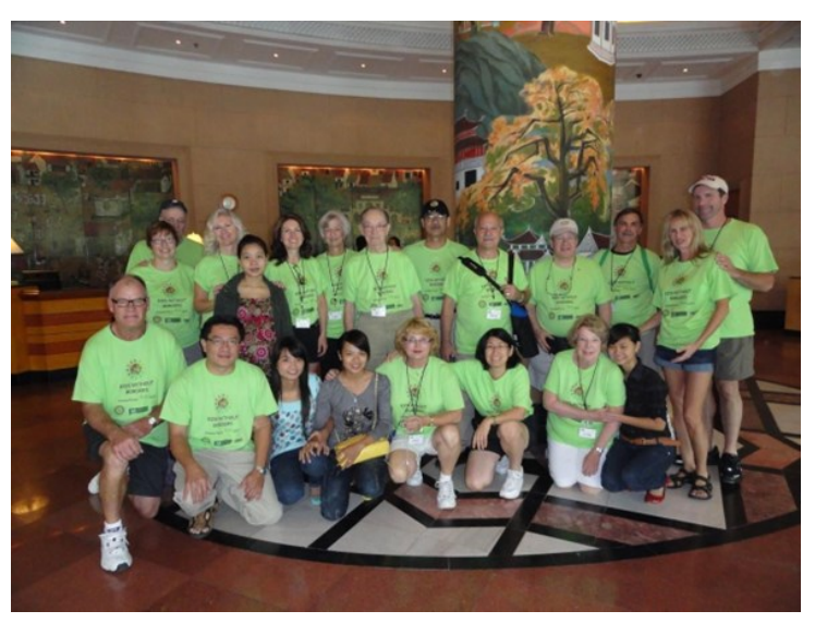
2015 Rotary mission to Viet Nam

In addition to the listed items, our team will have donated new children clothes and products. Some of the places on our itinerary: