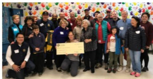
Packing food at Rotary First Harvest