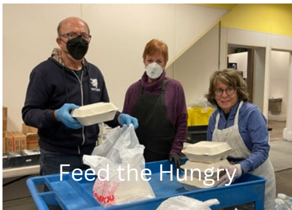
Feed the Hungry