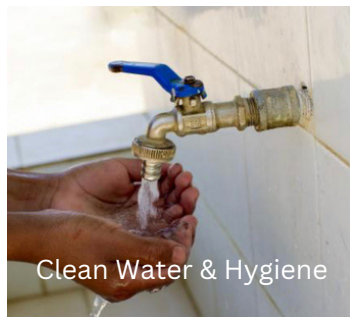
Clean Water & Hygiene