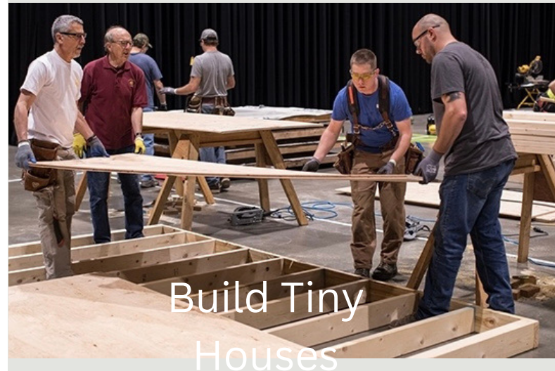
Build Tiny Houses