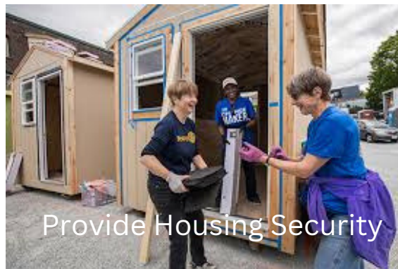
Provide Housing Security