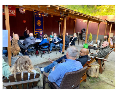
Our quarterly committee chair and project report-out at Big Block.