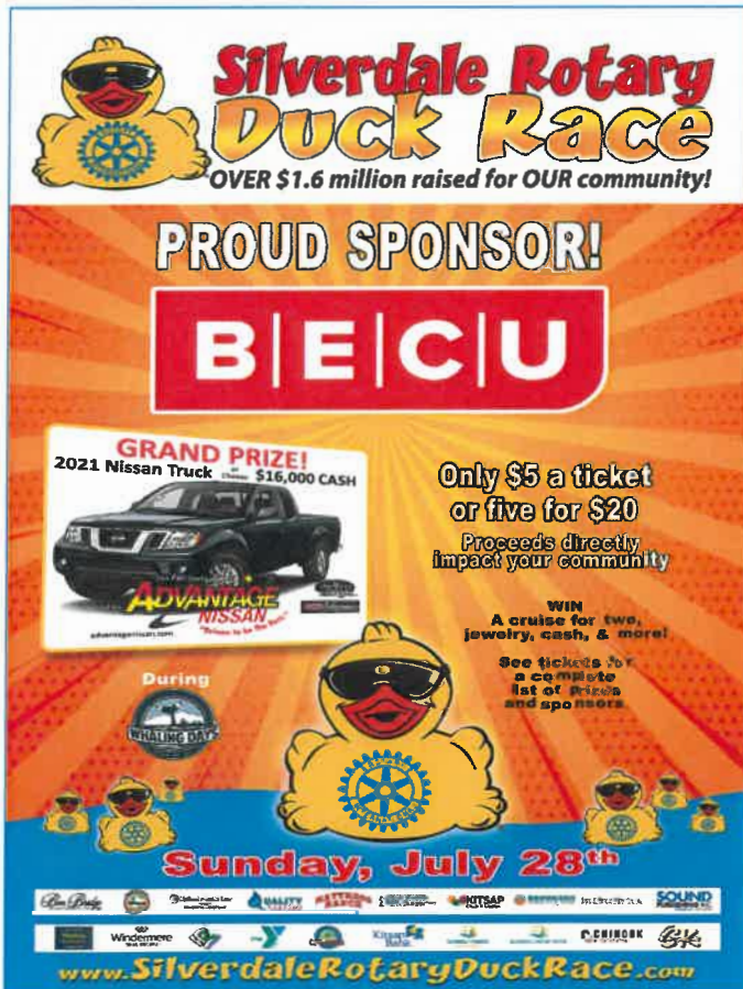
8.5" x 11" Printable color poster/flyer for sharing! Custom sizes may be available upon request.