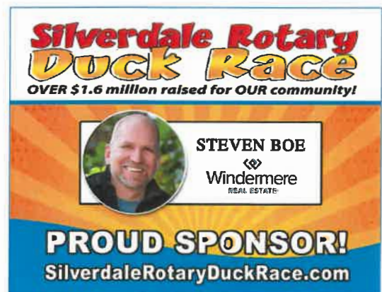
4.5" x 6" for printing custom postcards!