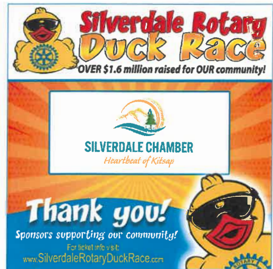
Perfect for sharing to Facebook & Instagram!