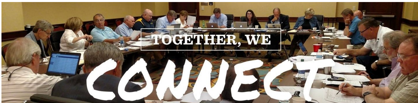
Zone 30-31 Visioning Facilitator Trainers with the District 6170 Governor line & District Visioning Chair