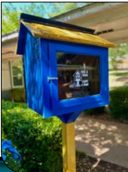
New library, courtesy Golden Strip Sunrise The Rotary Club of Golden Strip Sunrise built and installed a new Little Free Library at the Center for Community Services in Fountain Inn.

At June 27, RI was showing that we have increased by 87 members this year, from 2,397 to 2,484. However, as is the usual case, clubs tend to drop members as the end of the Rotary year approaches. Stay tuned for a final report when it's available.