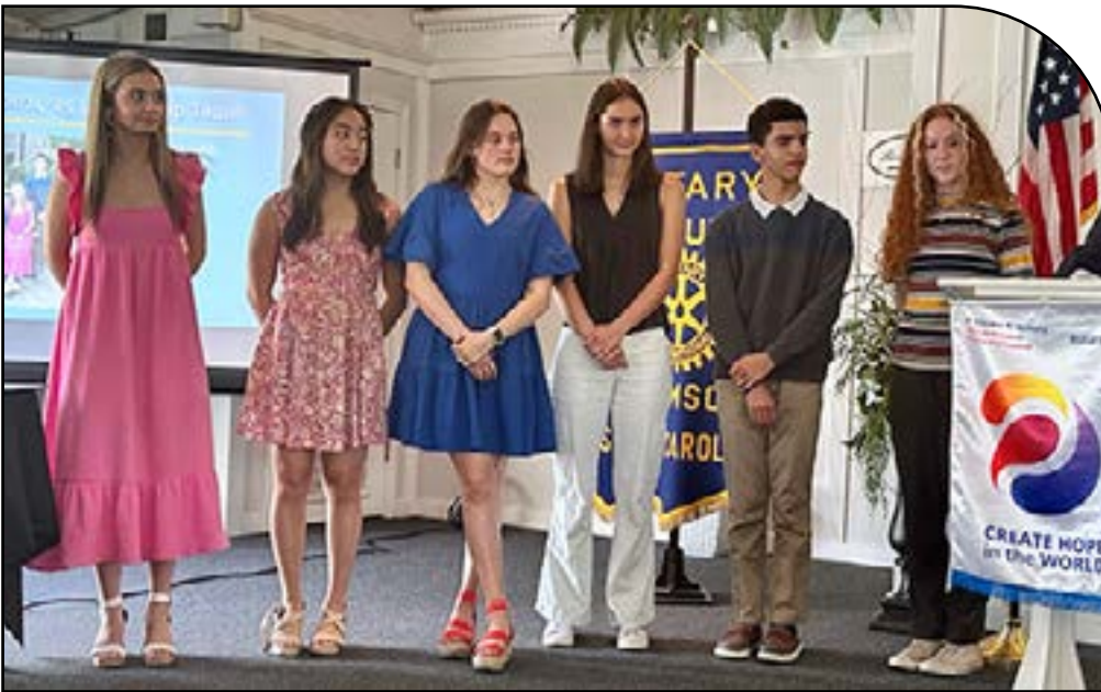
Some of the leaders of the Interact Club at Daniel High School: