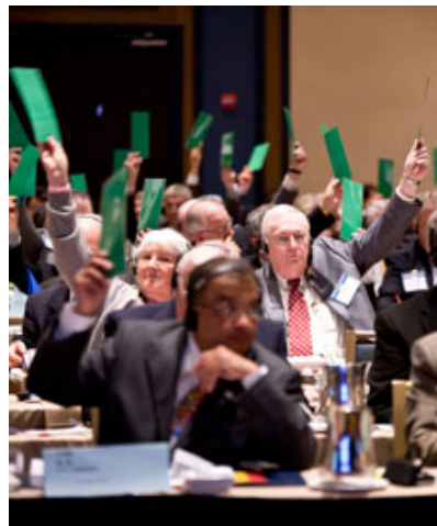
Delegates hold up voting cards during the 2010 Council on Legislation.

Every district sends a representative to the Council, and every club and district may propose legislation. The 174 pieces of legislation being debated during this year's Council were received at Rotary headquarters by the due date of 31 December 2011.