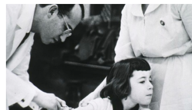
Dr Jonas Salk with one of the first children to receive the vaccine.