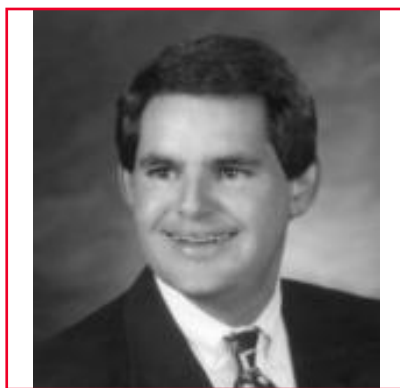
JOE E. LEWIS