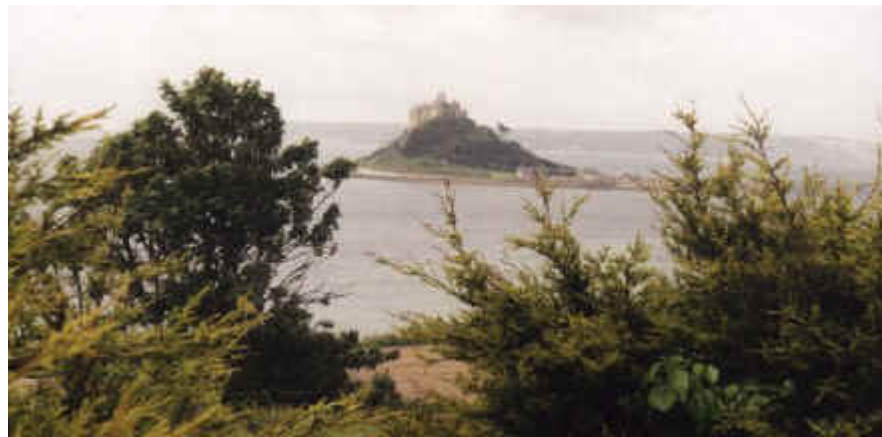
St. Michael's Mount, located in Mounts Bay near Penzance, is another place we visited. Lord and Lady St. Levan participated in portions of our tour of the castle and grounds.