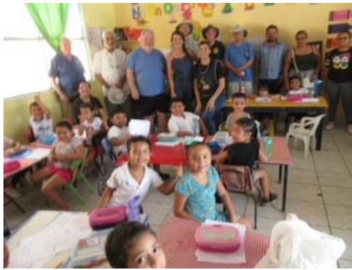
group with the La Penita club members at one of the kindergartens on the tour.