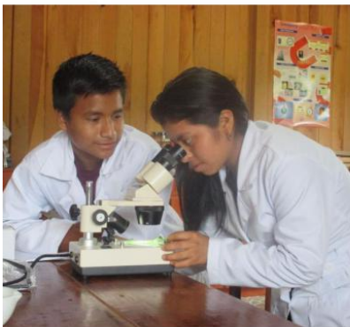
This project is providing funding for young Mexican women to learn to read and write.