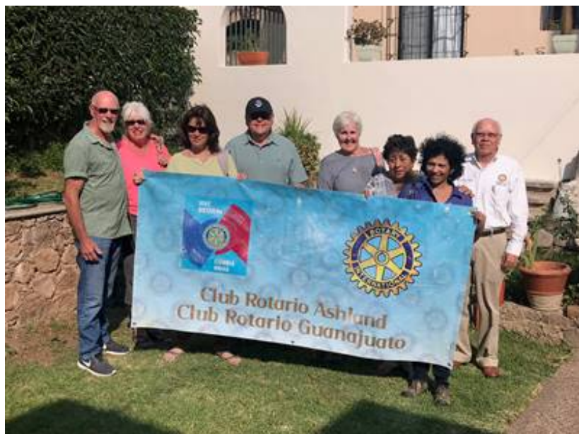
The Team, with Guanajuato hosts