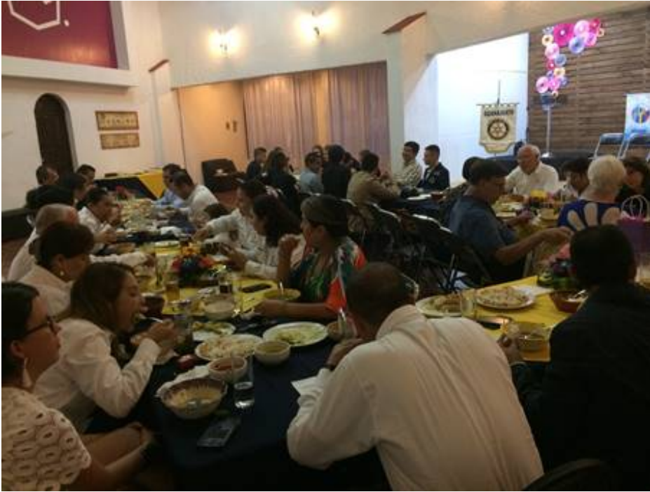
Club meeting –