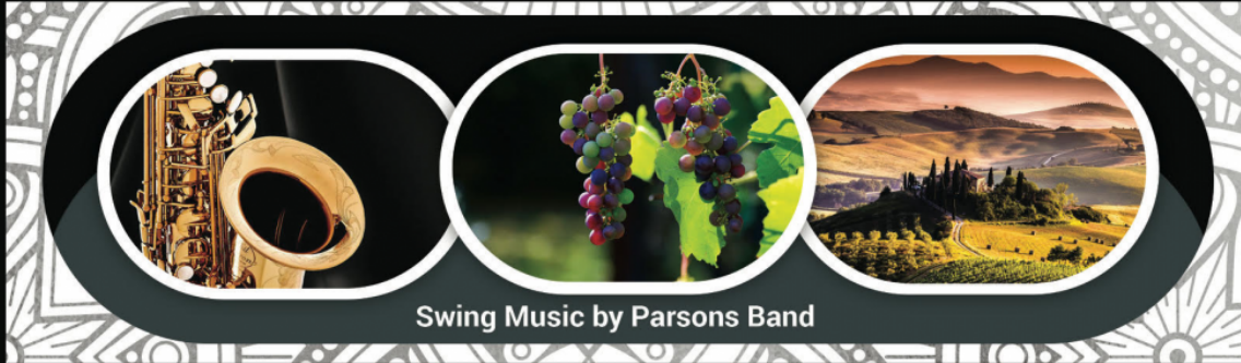
Swing Music by Parsons Band

$40 includes wine tastings, appetizers & dessert