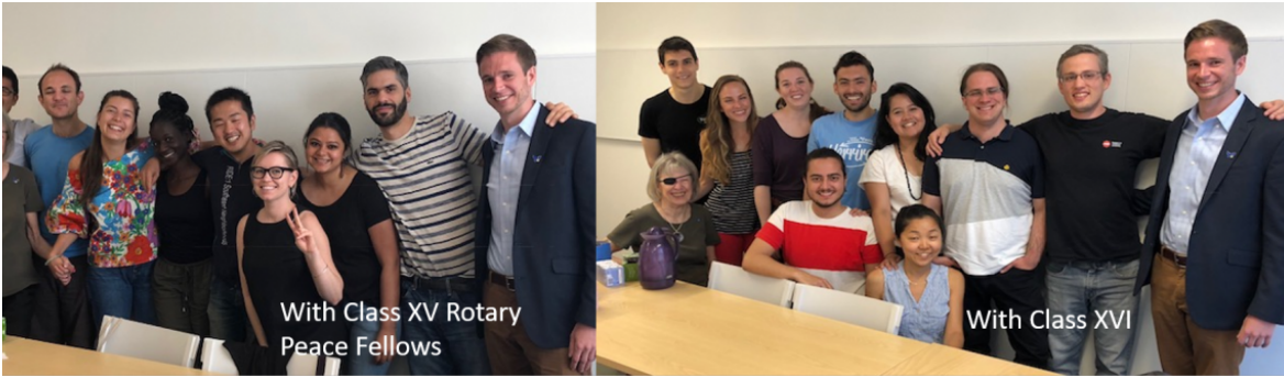
With Class XV Rotary Peace Fellows