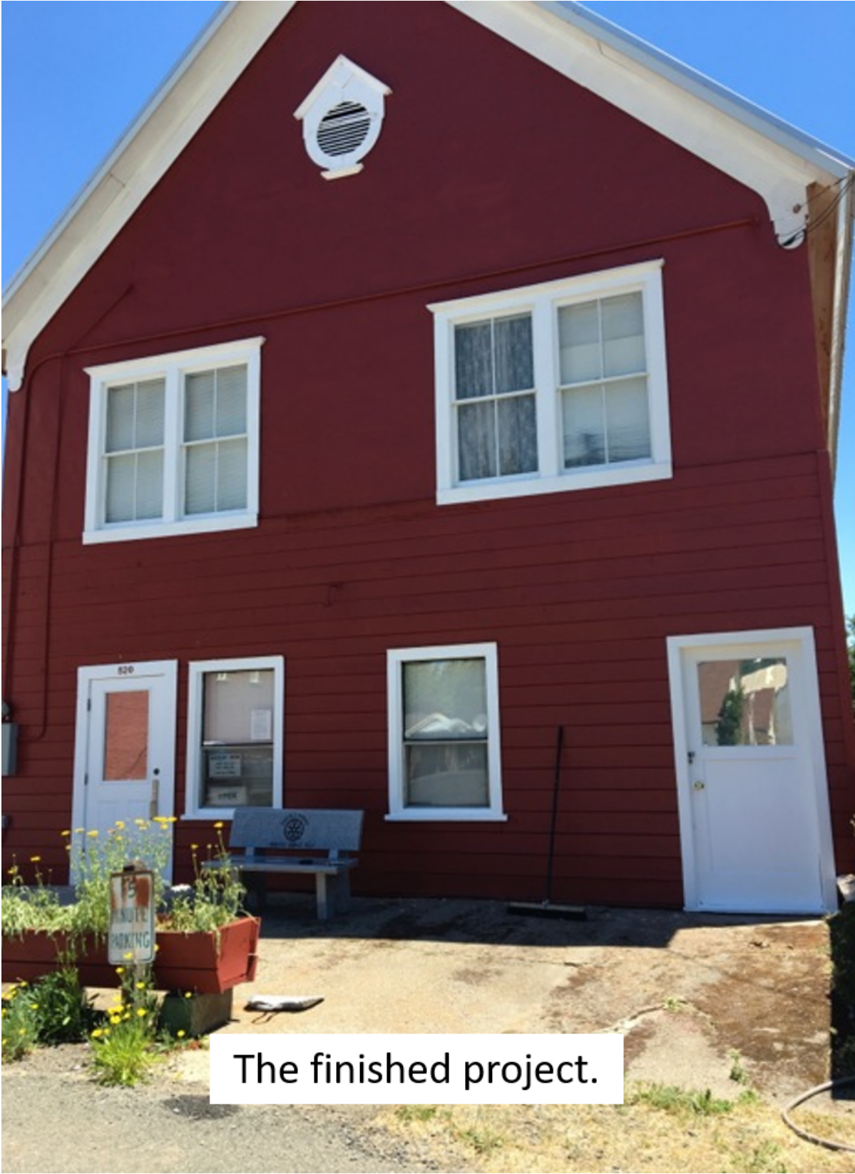
The finished project.

participated and to the generosity of the Scott Valley community.