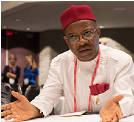
A Rotary Peace Fellow at the 2017 Convention in Atlanta.